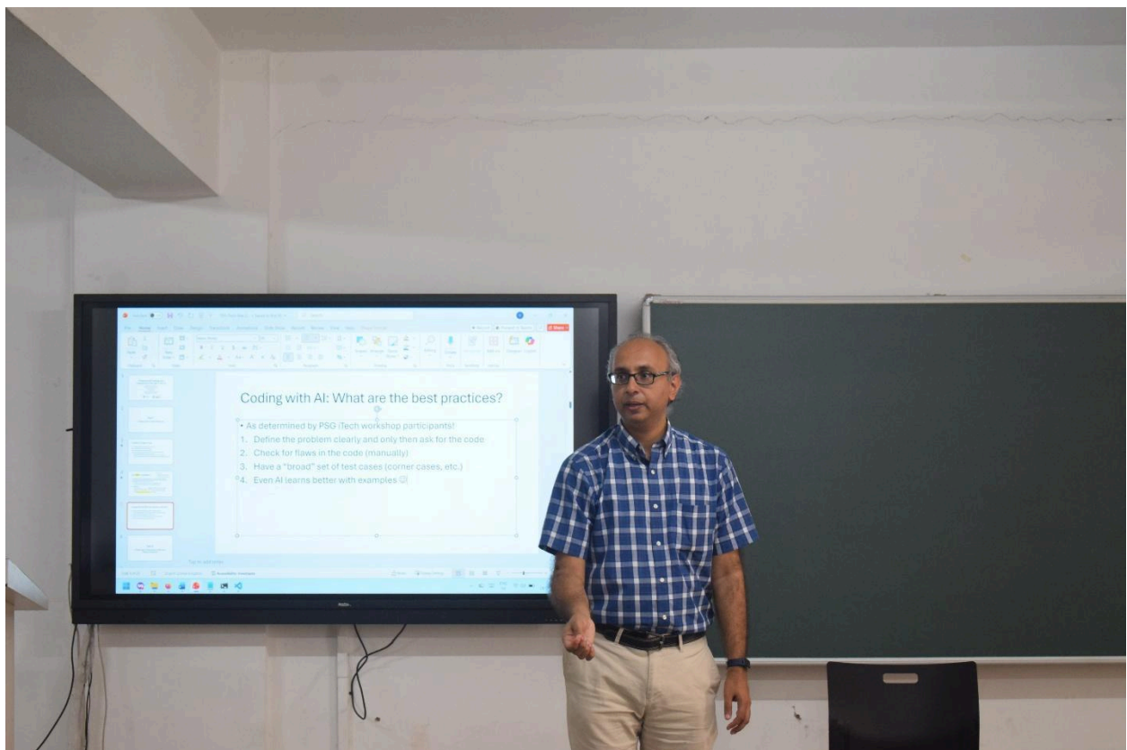
Resource person delivering the session