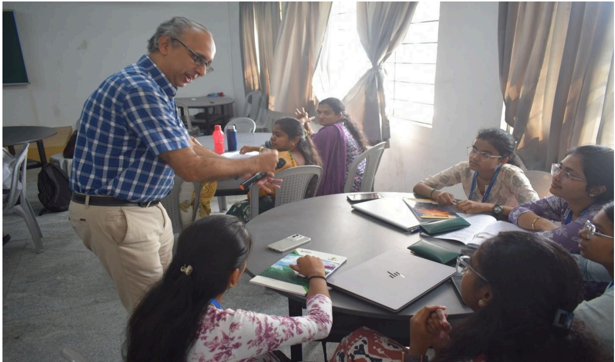
Resource person interacting with the participants

Post event professors from PSG iTech provided feedback on the session. Participants mentioned all the sessions were enjoyable and insightful session. Further faculty mentioned that refute coding problems will be implemented and assessed by the faculty members at PSG iTech. ACM faculty coordinators thanked the resource person and ACM for hosting such an eminent speaker and adding value to the programming teaching and learning at PSG iTech.